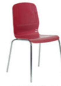
IML PF-GL 01