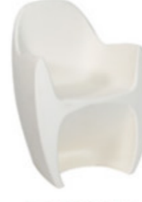
IML PF-LO 01