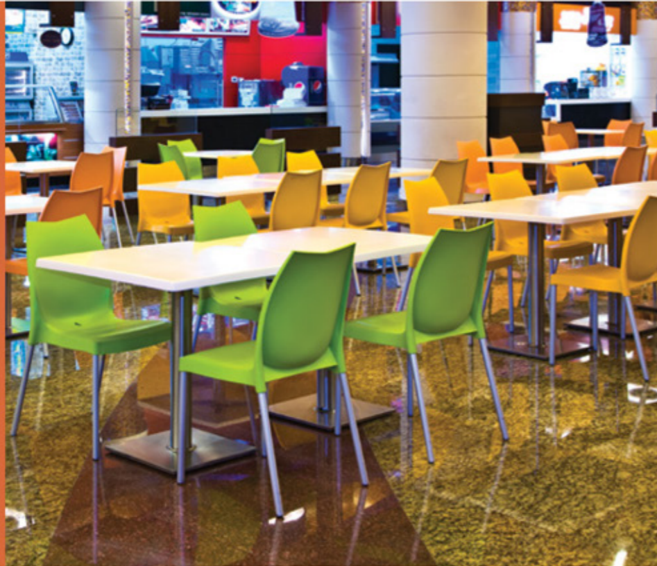
TABLE TOPS & BASES